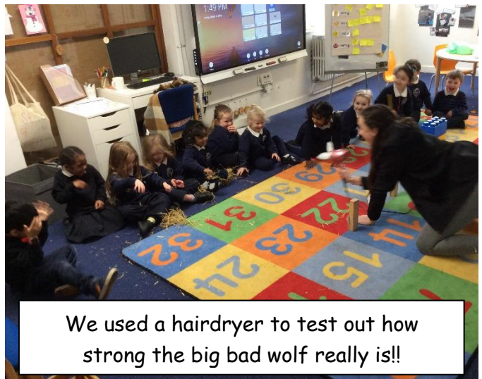
We used a hairdryer to test out how strong the big bad wolf really is!!